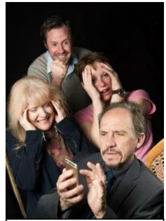
The cast of God of Carnage

Studio has been a member of the Little Theatre Guild of Great Britain since the late 50s. At the time, it was the littlest of the Little Theatres - drama clubs that owned and ran their own premises. This year, we have also joined the ranks of the National Operatic and Dramatic Association, which is open to any drama or musical society and brings a myriad of potential benefits including regular reviews of our productions. Reps have so far attended Jane Eyre and God of Carnage and been suitably impressed.